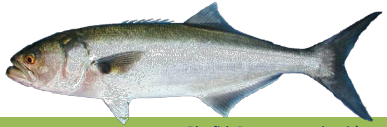
Bluefish Pomatomus saltatrix